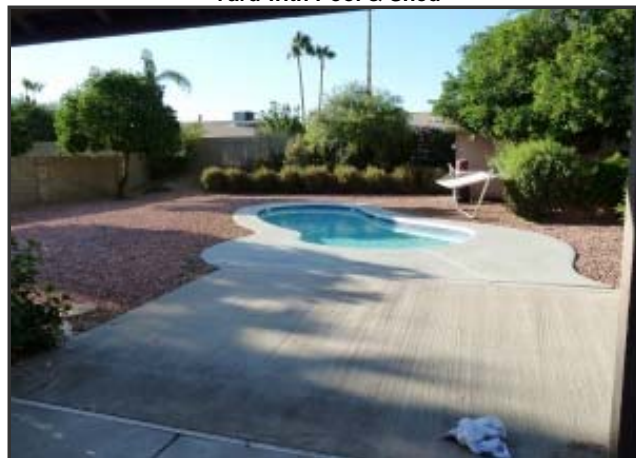
Yard with Pool & Shed